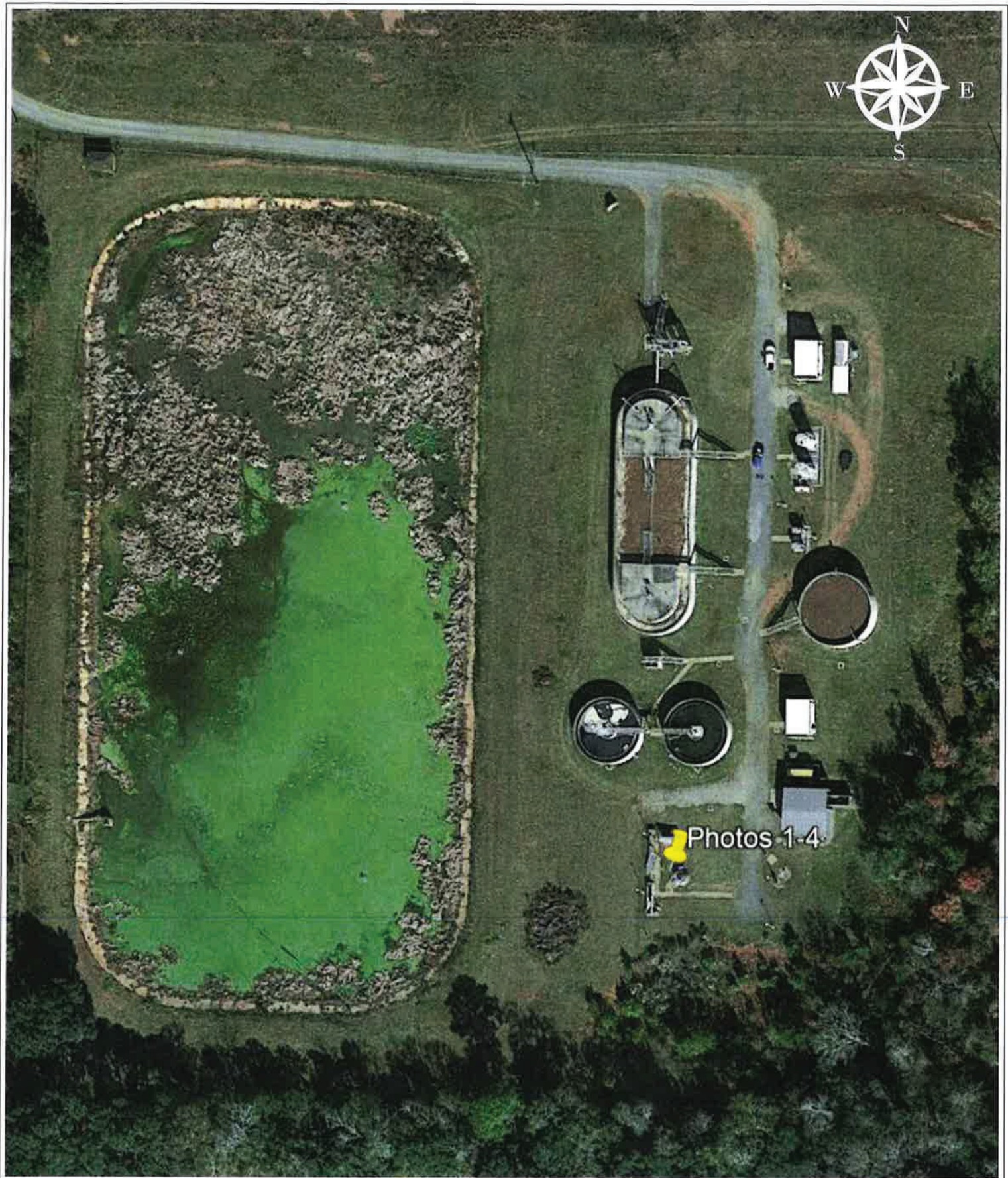
Photo Key Map

WASTEWATER TREATMENT PLANT IMPROVEMENTS FOR THE CITY OF LEESBURG LEE COUNTY, GEORGIA CWSRF APPLICATION MAP