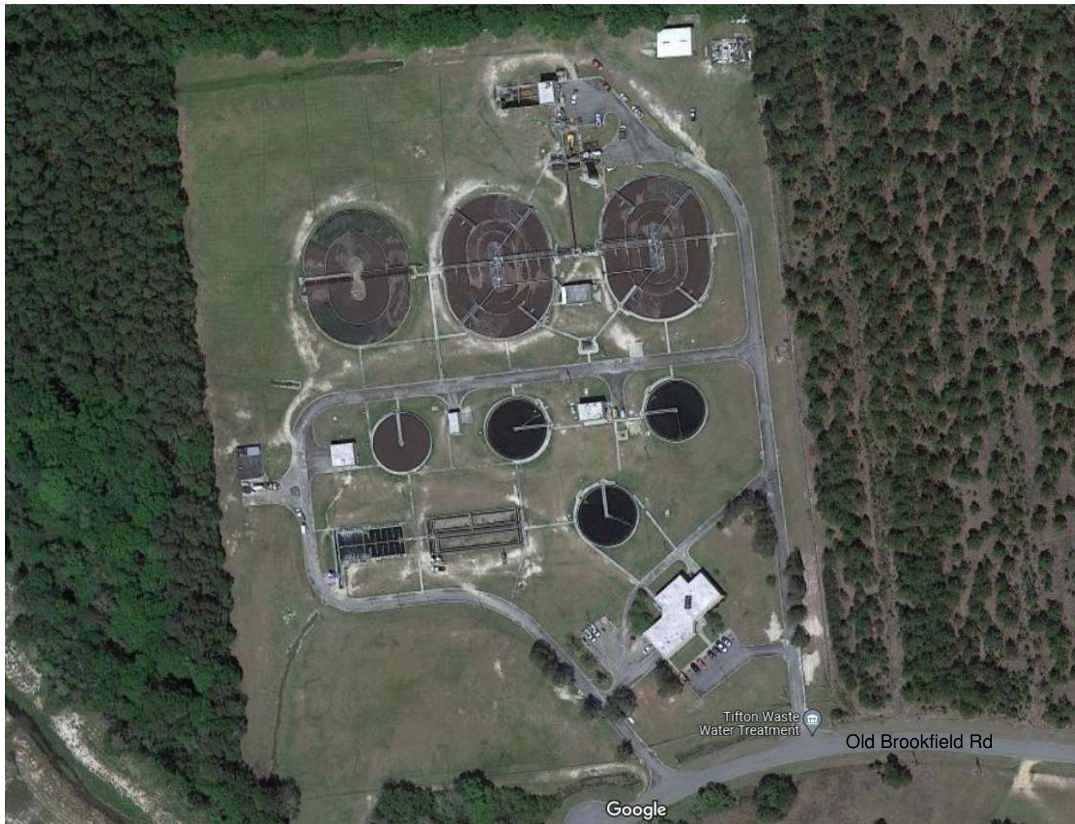
City of Tifton Wastewater Treatment Facility

31°26'48.4"N 83°28'38.8"W 31.446767, -83.477453