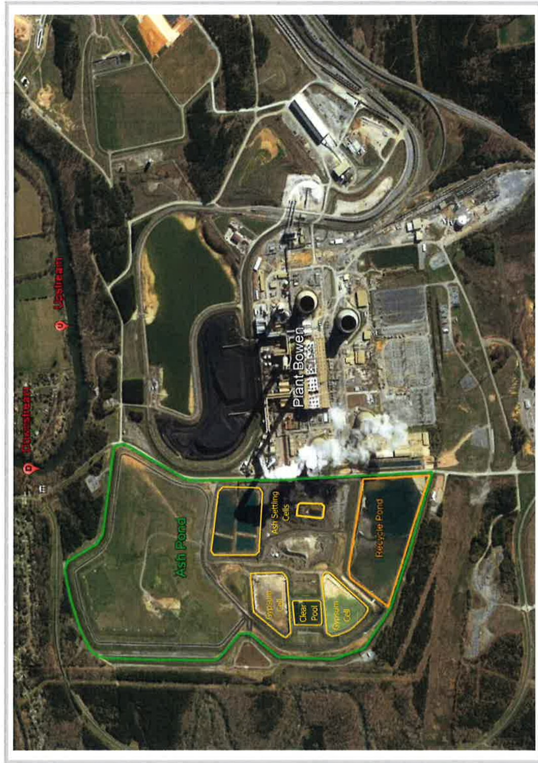
Figure 3 Plant Bowen Ash Pond