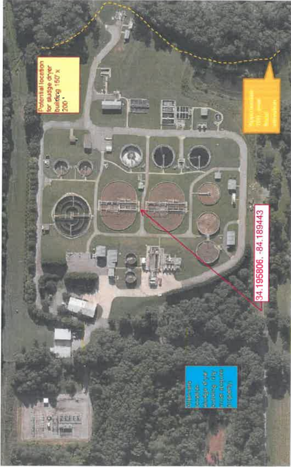
Figure 1 -Location for new sludge dryer building