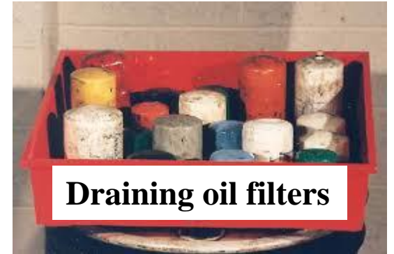
Draining oil filters

Non-terne used oil filters should be hot drained into a properly labeled container for at least 12 hours . Once the oil filter is properly drained, the filter can be disposed of as a solid waste along with the other regular trash in your solid waste dumpster. If you choose not to hot drain the filters, then the filters should be managed as used oil.