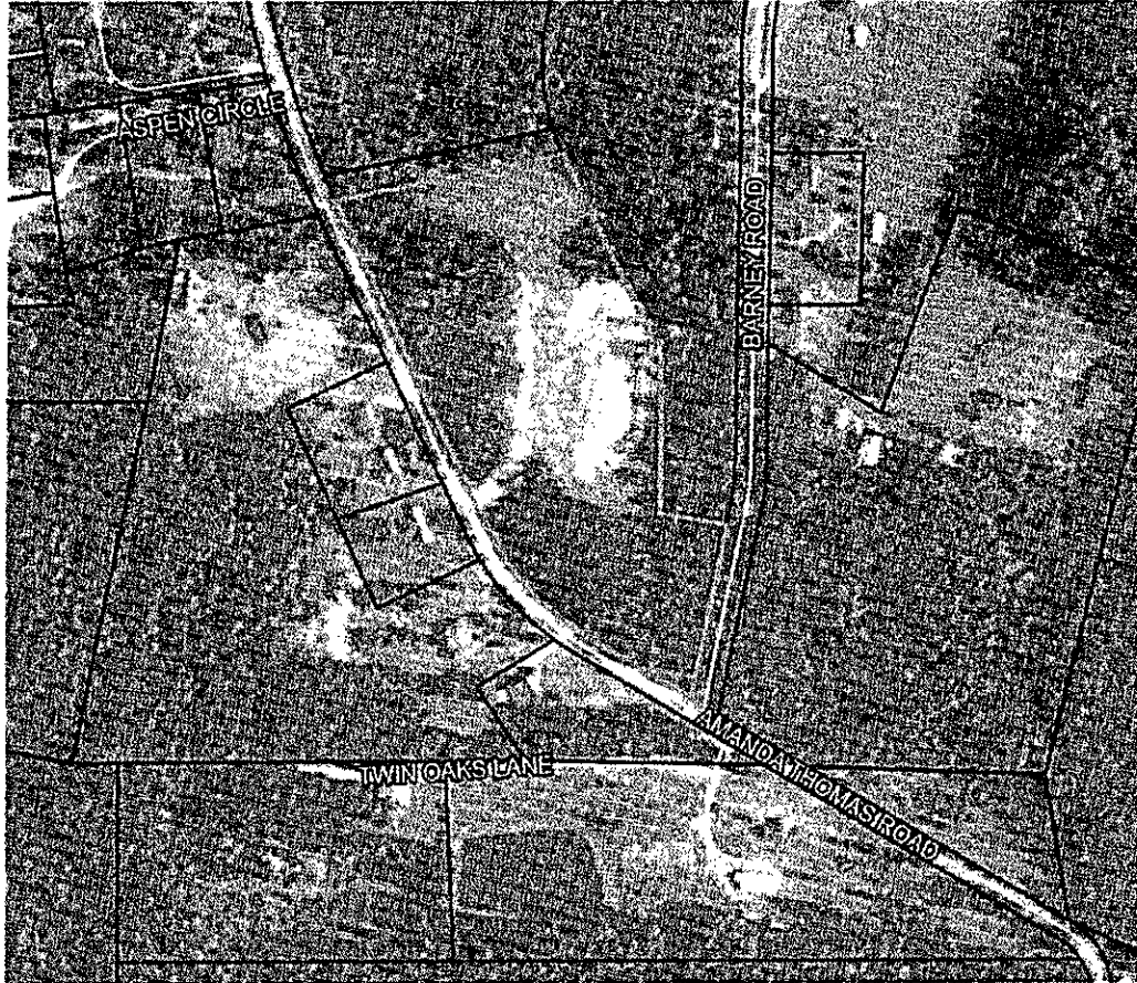
Exhibit B Map of Property