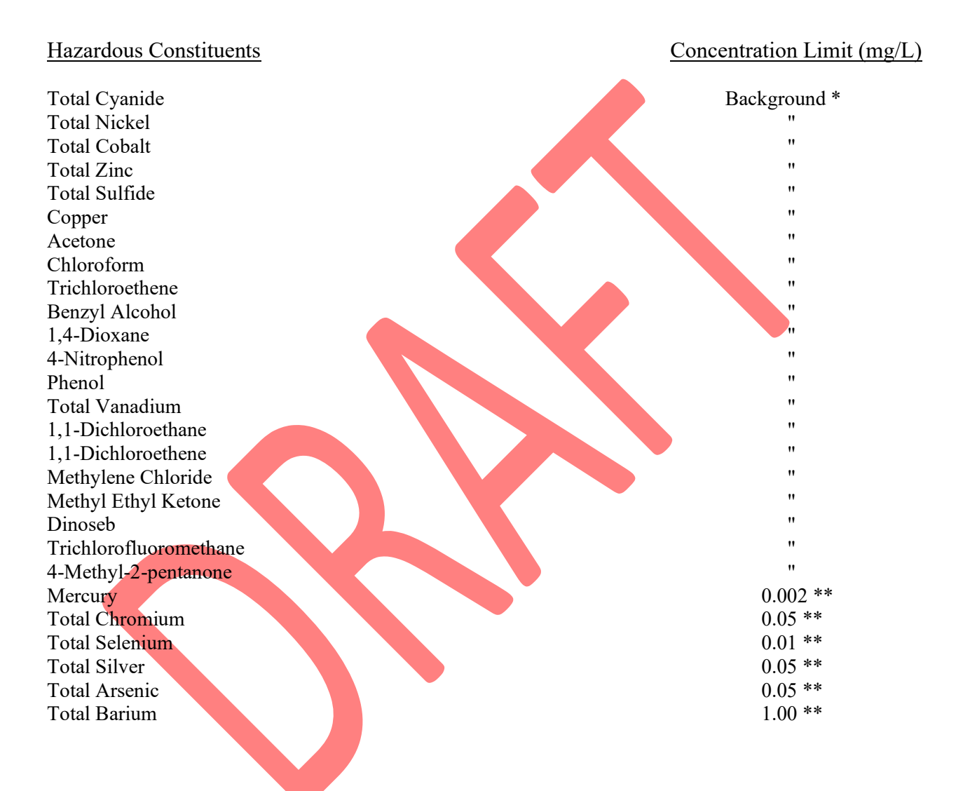
TABLE I: GROUNDWATER PROTECTION STANDARD DCSI AND CCSI

*Background concentration limits shall be calculated according to the procedure described in 40 CFR 264.97.