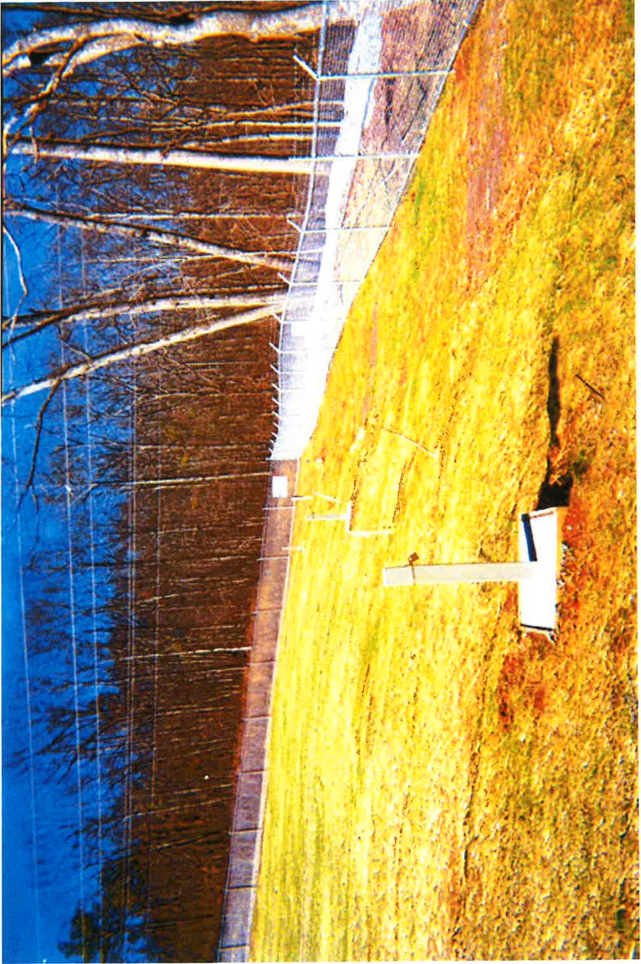
Milledge Avenue Landfill