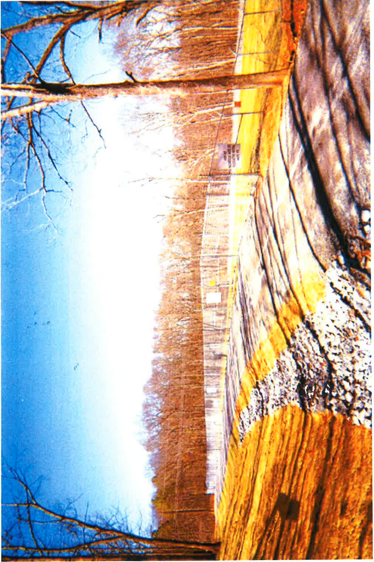
Milledge Avenue Landfill