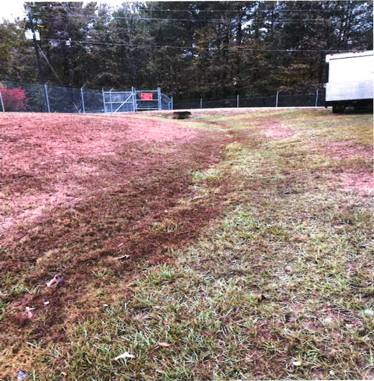
Ditch at the HMTF