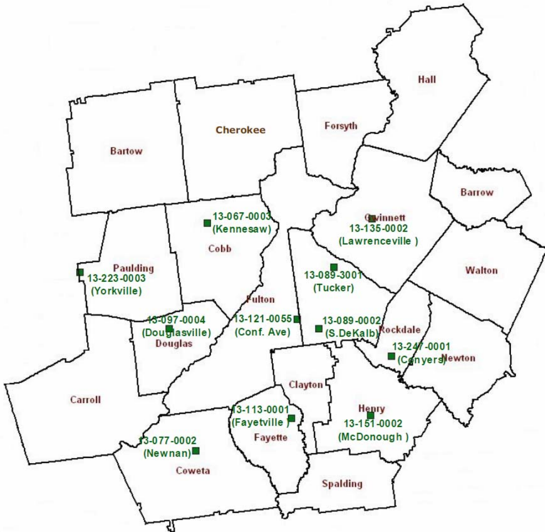
Figure 2-1. Locations of ozone monitors within the Atlanta 20-county nonattainment area.

development of the Photochemical Assessment Monitoring Stations (PAMS) network, the Yorkville (13-223-0003), South DeKalb (13-089-0002), and Conyers (13-247-0001) ozone monitors were designated PAMS sites, as well. Two sites are currently not operating, the Tucker-Idlewood Road monitor (13-089-3001), which is permanently shutdown, and the Fayetteville-Georgia DOT (13-113-0001) monitor, which is temporarily shutdown. Table 2-1 lists the metro Atlanta ozone monitors shown in Figure 2-1 and their respective start dates.